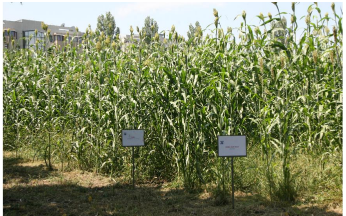
Fig. 1. The culture of sugar sorghum

the heated juice does not stick to the bottom of the boiler (distillation vessel).