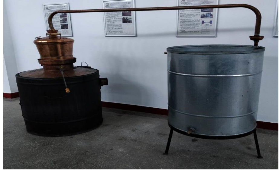
Fig. 3. Installation for distillation / obtaining raw alcohol (IOAB)

width: 950 mm weight: 112 kg. cooler (Condensing vessel): volume: 450 liters - volume: 450 liters - height: 1660 mm width: 850 mm weight: 35 kg.