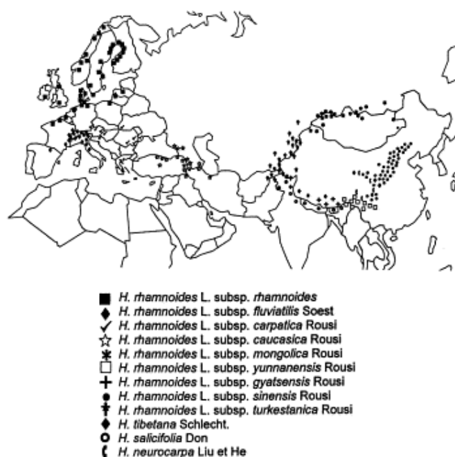
Fig.3. The natural distribution of sea buckthorn in Europe and Asia (source: Yang B. and Kallio H., 2002)