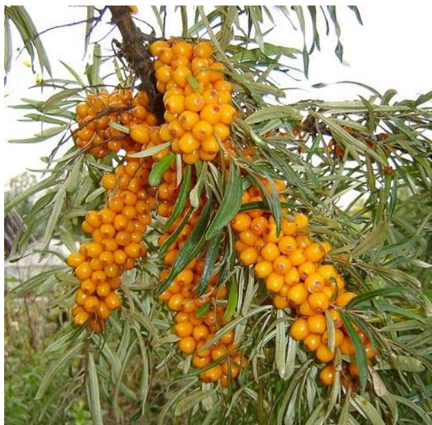
Fig.1. The fruits of the sea buckthorn