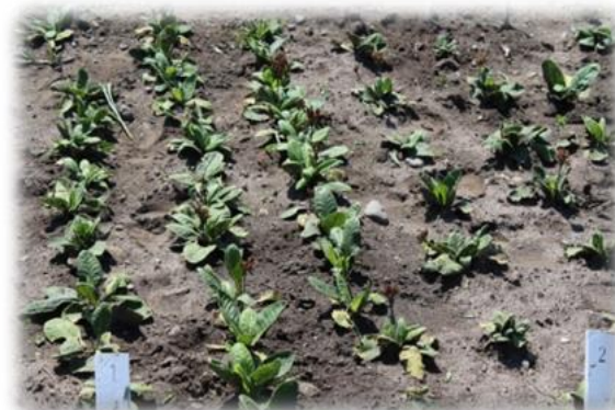
Figure 1. Aspects from field during the vegetation period 2017