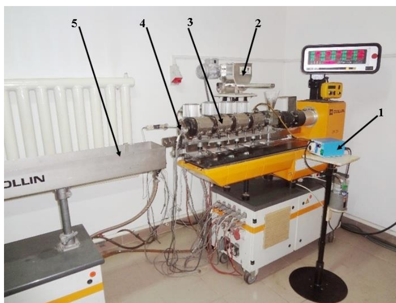
Fig.1. The installation for realization of granular fertilizer biocomposite material based on peat

cylinder is also modular and has 5 zones (Z1-Z6) removable and interchangeable with each other, each with independent heating and cooling. The extruder is provided with an ECS control microprocessor, with the possibility to adjust and maintain the temperature in the five working areas of the extruder, adapter and die. The part of the cylinder that form the area Z2 has an orifice for dosing liquid components (plasticizers).