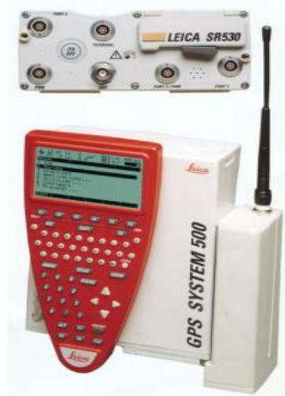
Figure 2. Leica SR530 GPS