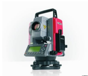
Figure 1. Pentax V227-N total station

Surveying works were carried out with a total station PENTAX V227-N and Leica SR530 GPS receiver.