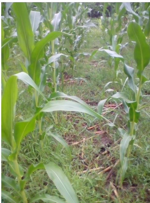
Figure 3. No till with pea mulch at 10 July

The tillage helps keeping the water into the soil by creating a layer of soil with larger pores than below the depth of tillage. This is the reason why the plowed soil gives good yields. The no till bare soil records the lowest soil moisture data because of losing water quickly. The phenomenon that conducts to this result