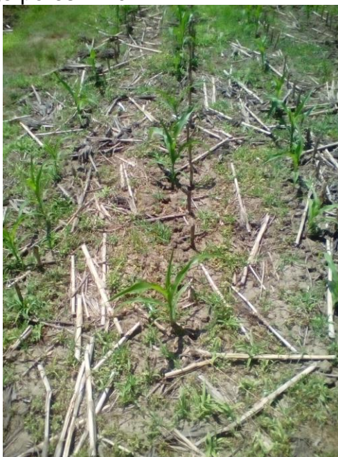
Figure 1. The no till with mulch variant at 1 st of june

reduces the access of water from beneath to the soil surface where it will rapidly lost by evaporation. The seedbed was prepared only on the width of 10 cm and a depth of 10 cm. There was applied Adengo herbicide (isoxaflutol 225 g/l + tiencarbazon-metil 90 g/l + cipro sulfamide (safener) 150 g/l) when the corn plants reached 10 cm height. This herbicide did not controlled Digitaria sanguinalis weed. During the vegetation period there were made soil moisture determinations at two dates: 1 of june and 10 of july. There were, also, made soil bulk density determinations and. At harvest the corn plants were measured as height. The yield was weighted by plots and the results have been statistically interpreted by Fisher analysis of variance.