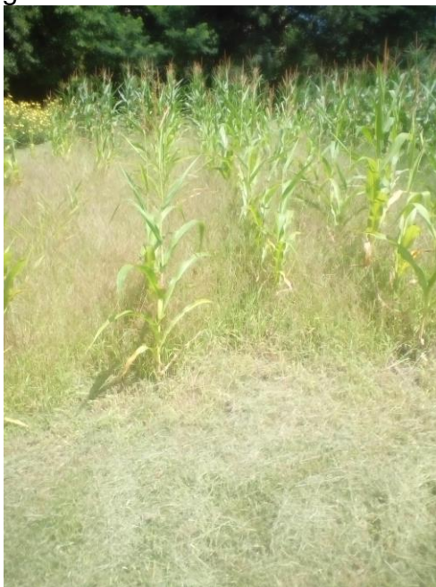
Figure 2. No till without mulch variant at 10 of July

so there was a high degree of weeding with this weed, especially with no till plots without mulch layer.