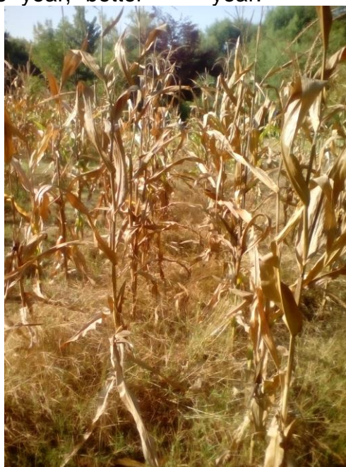
Figure 4. No till with pea mulch at harvest.

than plowed variant. The no till without mulch variant almost gave no yield, this year.