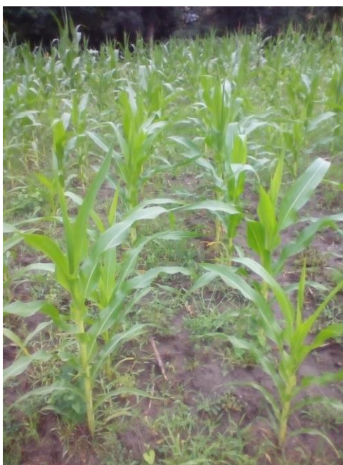
Figure 3. Plowed variant at 20 June.

is explained by smaller pores into the shallow layer of 3-5 cm that extracts the water from below, where the soil pores are larger. This fact determines the rapid loss of soil water, tough soil, poorly developed root system and reduced or no yield.