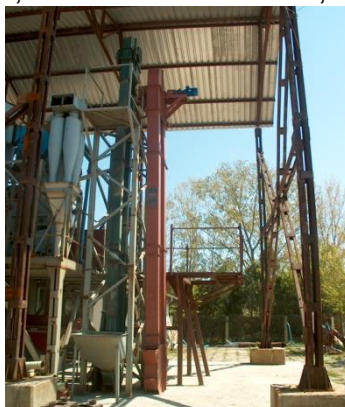
Fig.1 - Elevator with conveyor belt and buckets

belt with buckets, unisens device, head suction, foot suction, housing (Figure 2).