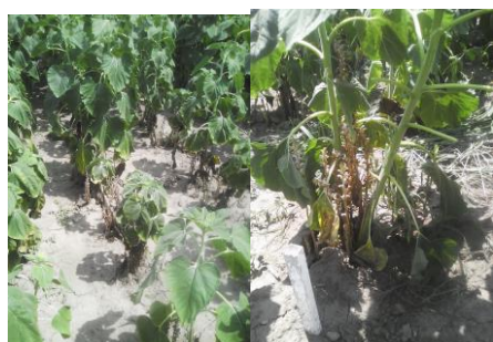
Picture 2. Braila area 2017, natural infestation on field

There are differences between intensity of broomrape attack in natural condition of infestation in Braila area 2017 between stage of sowing ( figure 2 ). In case