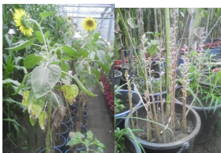
Picture 1. Artificial infestation in greenhouse in year 2017, with broomrape collected from Braila area 2016

condition, in greenhouse at NARDI Fundulea.