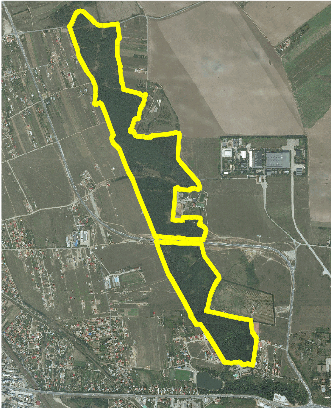
Fig. 2. Surveyed forest surface superimposed on orthophotomap