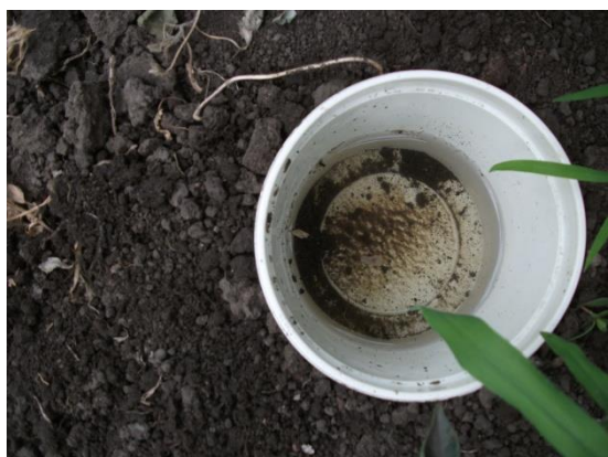
Fig. 1 Soil trap type Barber (original)

The collected material was brought to the laboratory, and the insects were determined and inventoried.