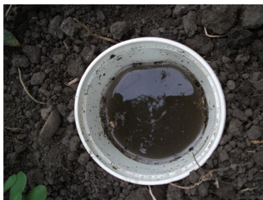
Fig. 2 Entomofauna collected by the Barber soil trap (original)