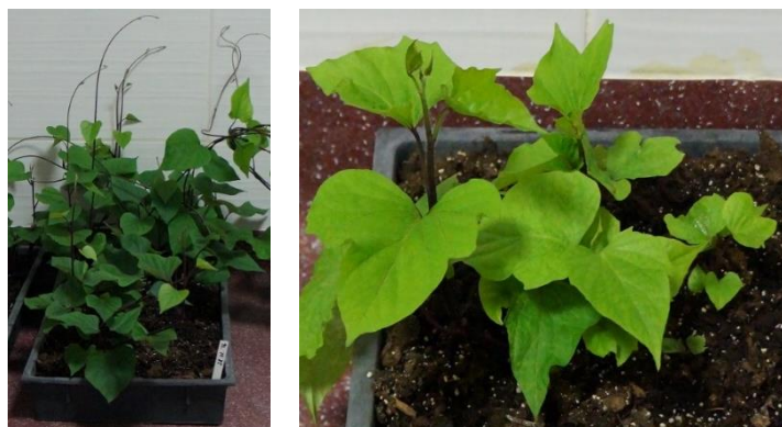
Fig. 1 Sweet potato shoots 80 days after tubers planting

The study was carried out at the National Institute of Research and Development for Potato and Sugar Beet (NIRDPSB) Brasov, Research Laboratory for Plant Tissue Culture. The biological material analyzed in the experiment was represented by five sweet potato varieties: Yulmi, KSC1, KSP1, Hayanmi și Juhwangmi. The sweet potato storage roots used for obtain vine cuttings were provided by Research and Development Center for Plant Growing on Sands (RDCPGS) Dabuleni, Dolj county, based on a joint research project (ADER 2.2.2.). Vine cuttings used to initiate in vitro culture were taken from mother plants obtained in protected area, approximately 80 days after tubers planting (Fig. 1).