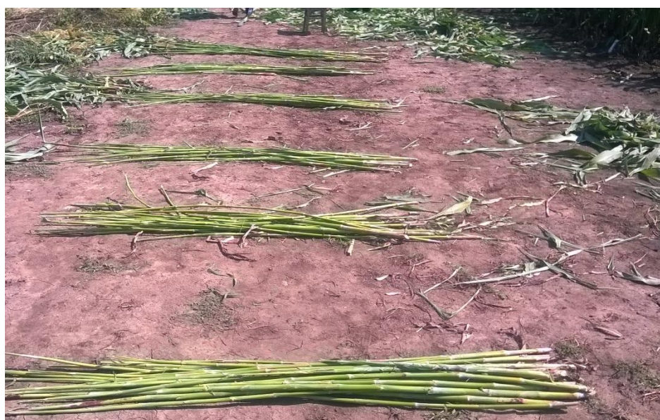
Figure 2 – Aspects from experimental fields determining the percentage of fractions of green mass yields on sweet sorghum hybrids in 2014

From the all components of biomass the stalks represent the most valuable component and ranged between 60.71 % at H5 and 79.34 % at H10 (figure 3). Closer values that the H10 were registered at H11 and H1 with a participation of 77.12 % and respectively 74.26% in total green mass production.