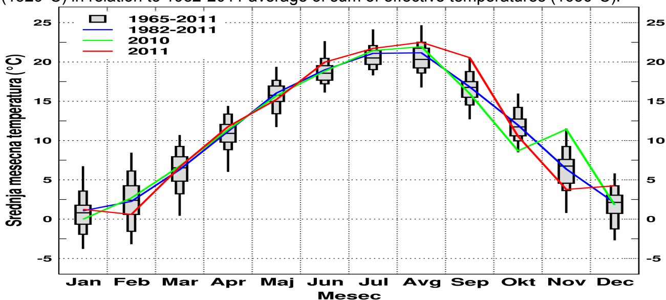
Graph 1. Mean monthly temperature for period 1982-2011

2011, sum of effective temperature was 1791°C, and was significantly higher than in 2010 (1529°C) in relation to 1982-2011 average of sum of effective temperatures (1636°C).