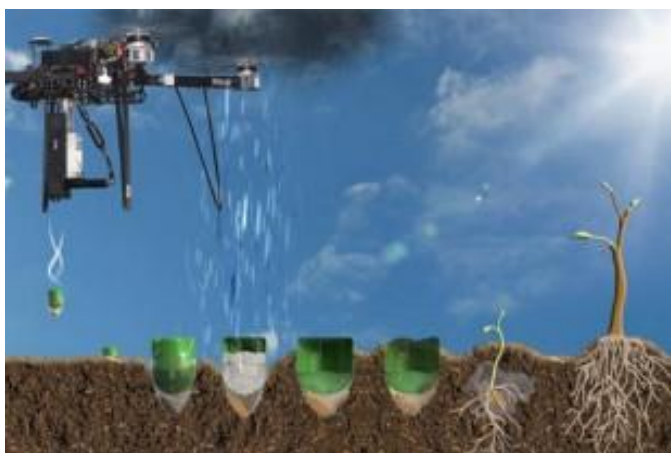
Figure 1. Seed Bombing Drone [1]

Planting crops and trees : Drones can be used for planting crops which can save labour cost and reduce human drudgery. As there would be no use of tractors for sowing crops in the field, drones can save fuels, reduce the emission of harmful gases formed during fuel exhaustion while operating tractors in the field, and can avoid the compaction of subsoil as well as formation of plough pan which generally forms due to repetitive movement of tractors on soil surface. Drones can be used to plant trees or crops in remote areas by throwing biodegradable seed pods or seed bombs (Figure 1). Thus, they can be used for the restoration of degraded lands by planting trees, and also for reforestation as well as afforestation activities [1].