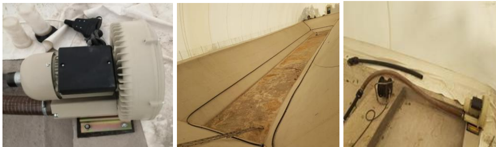
Fig.3. Aeration - oxygenation system with Osaga ORV aerators

This HDPE pipe was attached at a height of 1m from the bottom of the pond by means of collar type devices, the total length being 130 ml, and from 100 mm to 100 mm the diffusion devices were made (2 orifices with a diameter of 1 mm).