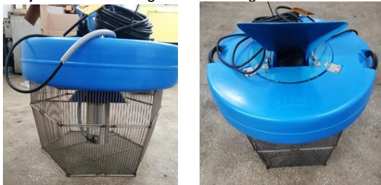
Fig.4. AQUA JET 0.75KW Aeration - oxygenation system with submersible motor and directional jet

good water circulation and increased oxygenation. The water jet is directed, forming currents and thus achieving optimal oxygenation. AQUA JET is equipped with a 20 m cable, the action area being 3 meters, the circulating water being a maximum of 185 m 3 / h.