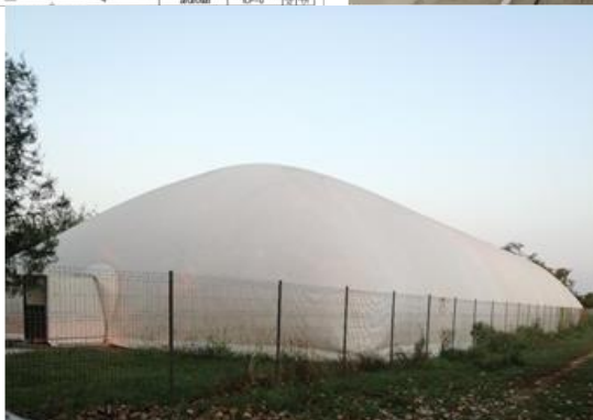
Fig.1. Technological system of intensive fish growing in polyculture system and complex capitalization of aquatic bioresources (plants), ICP 0

The feeding system is composed of 3 feeders provided with auger and