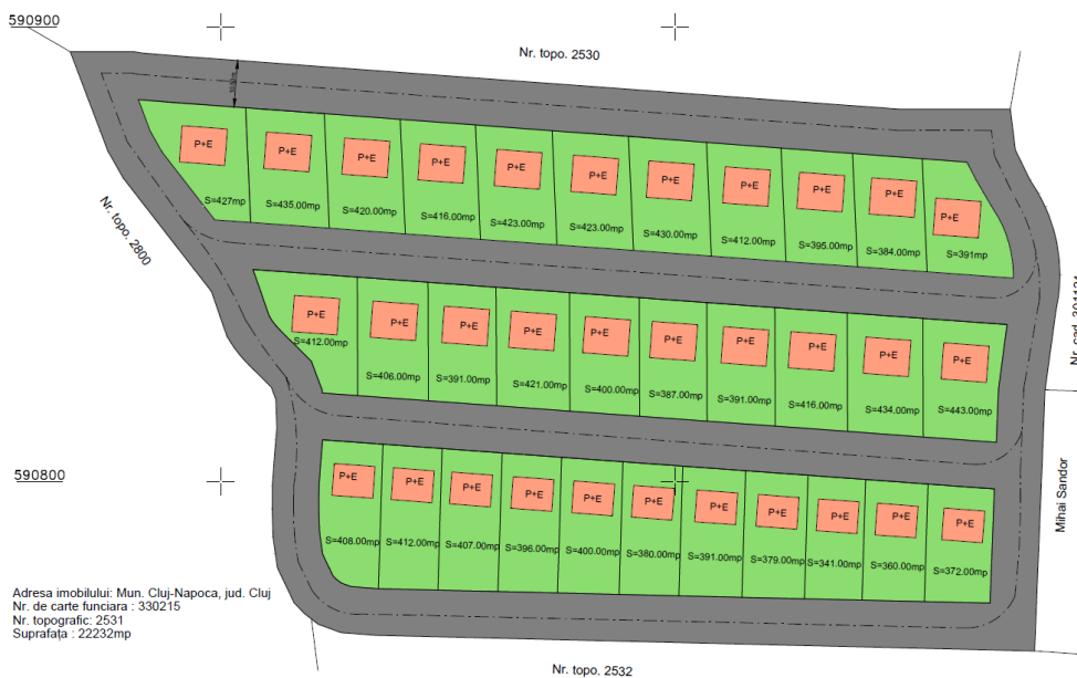
Figure 1. Area Town Planning