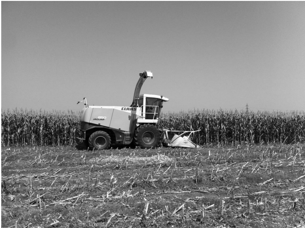
Fig. 1.1. Combine CLAAS JAGUAR 850.

The front equipment is an ORBIS 450 type, which offers the possibility of