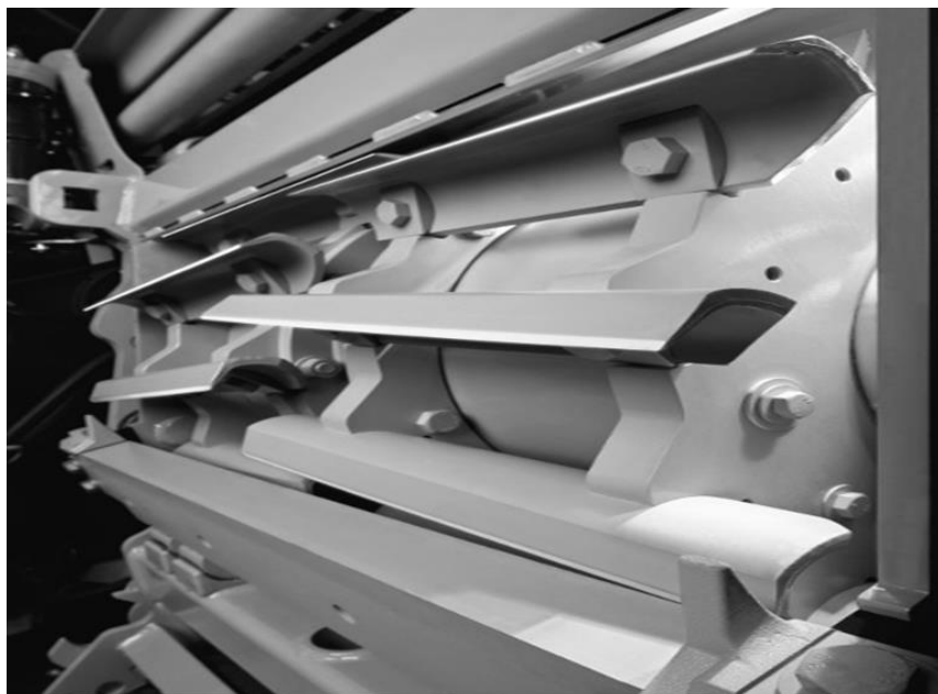
Fig.1.3. Chopping drum.

After the plants are subjected to the action of the chopping drum, the fragmented material is directed to the crushing rollers, represented by two counter-rotating rollers, which also have the role of accelerating the material, but also of breaking the corn grains to be more easily assimilated by animals. The grain breaker is followed by the thrower or fan, which sends the material at a speed of 60 m/s, loading it into the trailer.