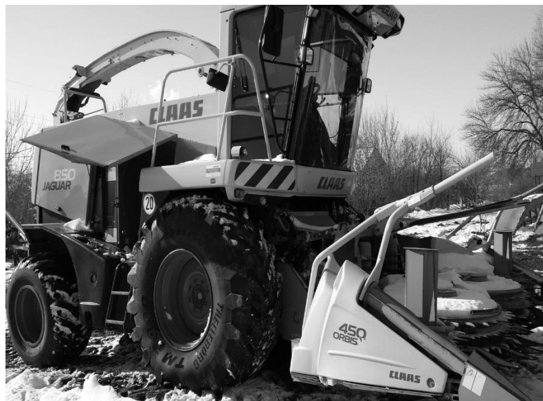
Fig.1.2. Combine Claas JAGUAR with ORBIS equipment.

harvesting even perpendicular to the rows of corn.