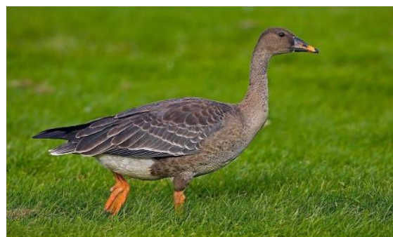
Figure. 3. Crop goose ( Anser fabalis )

Based on the AHP analysis, it can be observed that the crop goose is a rather expensive species, having high prices for the raw and derived products. Furthermore, the harvesting process is not complex, nor expensive, while the knowledge necessary for harvesting do not have to be high. On the other hand, the species is threatened by both biotic and abiotic factors, and the market request is not very high.