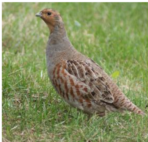
Figure 4. Partridge ( Perdix perdix )

biotic and abiotic factors posing a small threat, while the quantity harvested by a worker in 8 hours is high. However, the harvesting period and the distribution range are very small, while the prices of the raw and derived products are low.