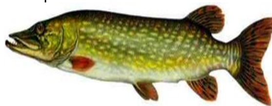
Figure 5. Pickerel ( Esox lucius )

factors, while the raw product's price and the market potential are low.