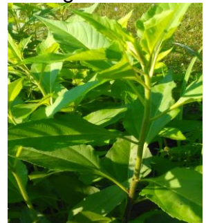
Fig. 1 Jerusalem artichoke culture

The Jerusalem artichoke crop, (figure 1) being in many ways similar to that of the potato, can be grown on soils with different degrees of water maintenance, in this category falling both clayey soils and the category of sandy soils. The best soils are well-structured ones that allow the roots to aerate for the smooth development of the tubers and with a proper drainage of water.