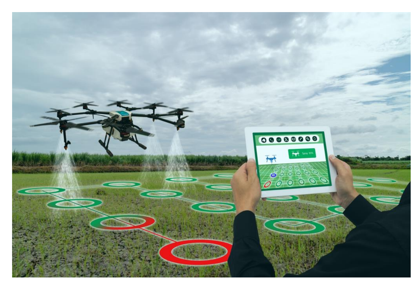
Fig. 3 Drones technology