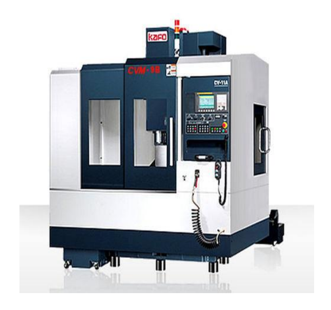
Fig. 5 CNC

Implementation of automation techniques Checking and ensuring the quality of products. [8]