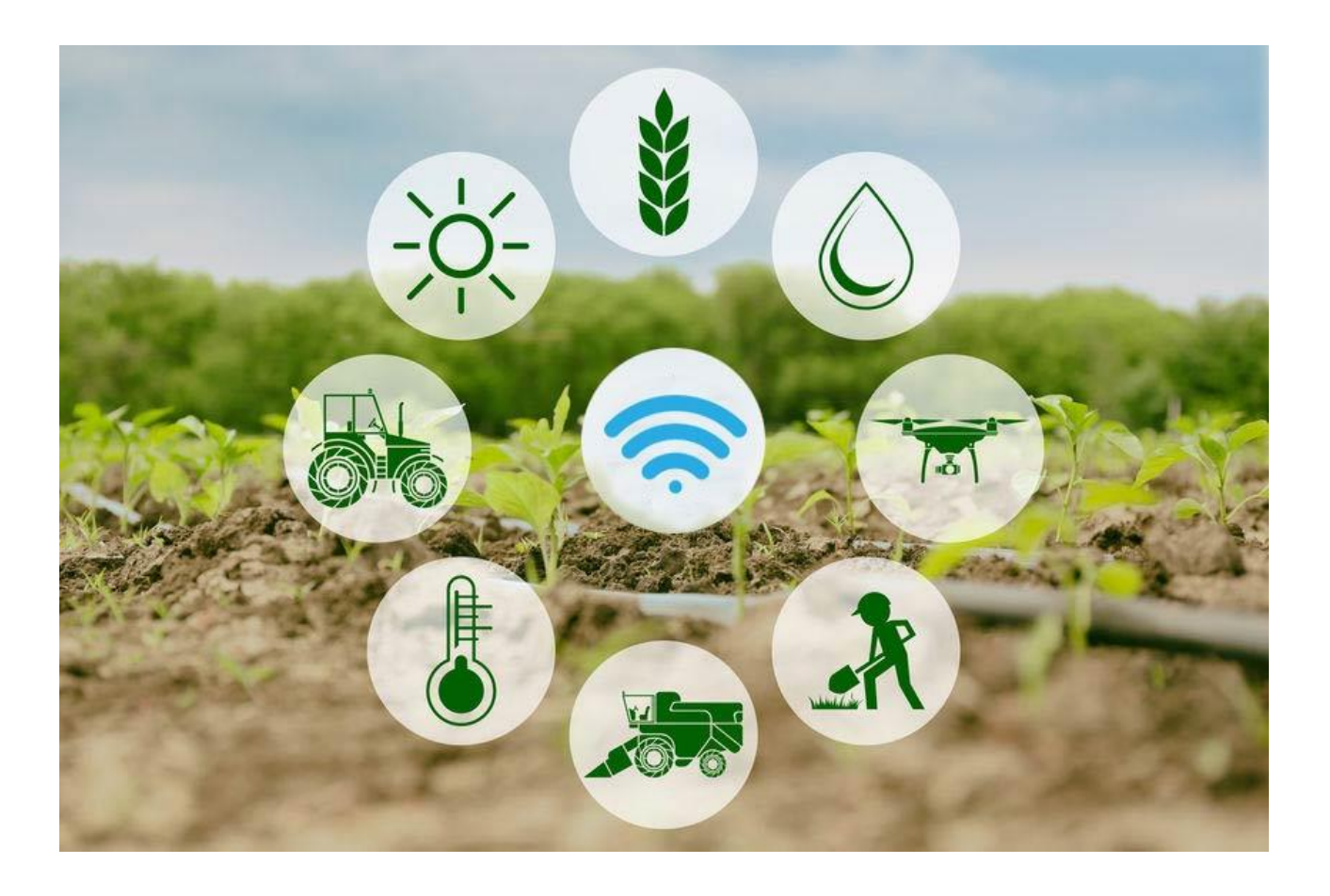
Fig. 1 Agriculture 4.0

Agriculture 4.0, the coming agricultural revolution, must be a green one, with science and technology at his heart. Agriculture 4.0 will need to look at both the demand side and the value/ supply side of the food-scarcity ecuation, using technology not simply for the sake of innovation but to improve and adress the real needs of consumers and reengineer the value chain.