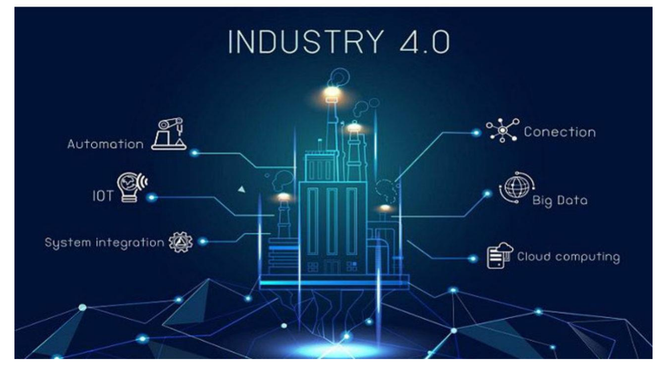
Fig. 2 Industry 4.0

UAVs may one day consist of autonomus swarms of drones, collecting data and performing tasks. The biggest obstacle to that becoming a reality is sensors capable of collecting high-quality data and number-crunching software that can make that high-tech dream a reality. [7]