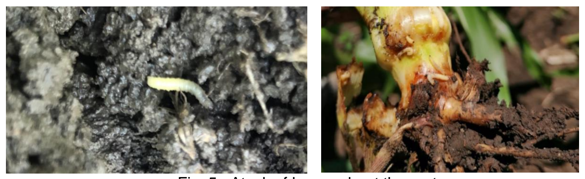
Fig. 5. Atack of larvae about the roots