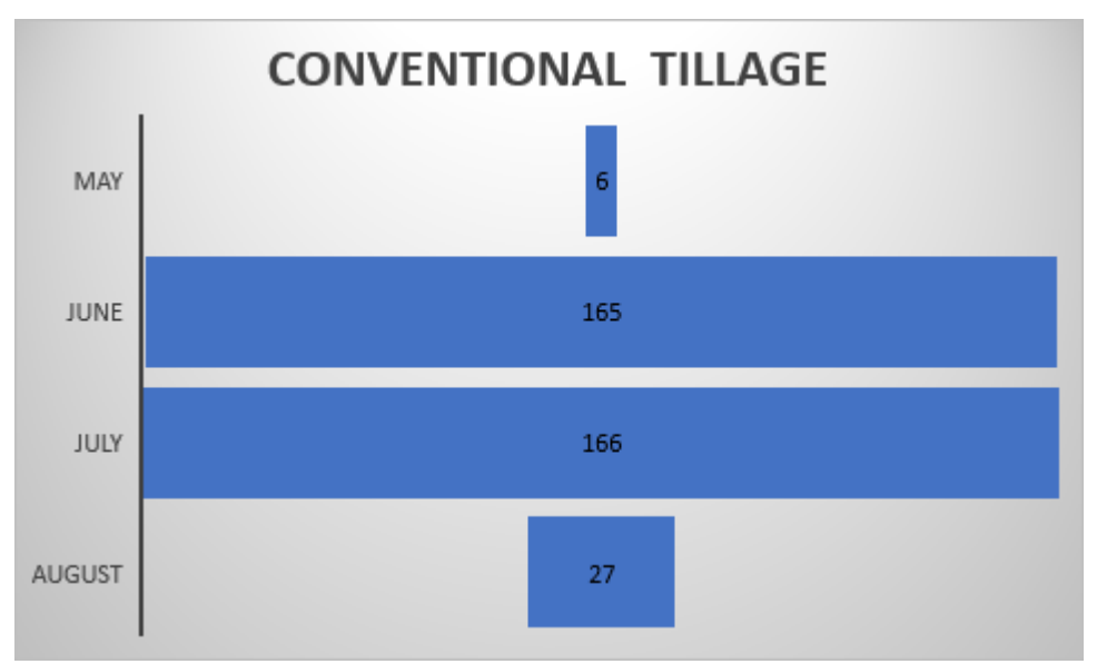
Fig. 3. Situation of collections in variant 3 – Conventional tillage work system