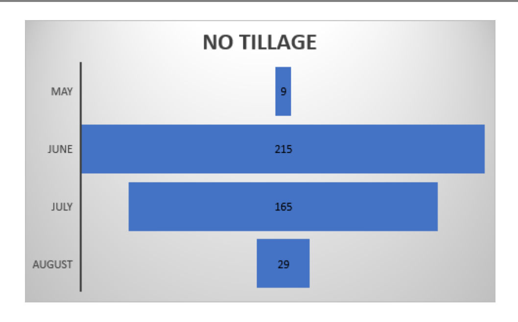
Fig. 1. Situation of collections in variant no.1 – No tillage work system