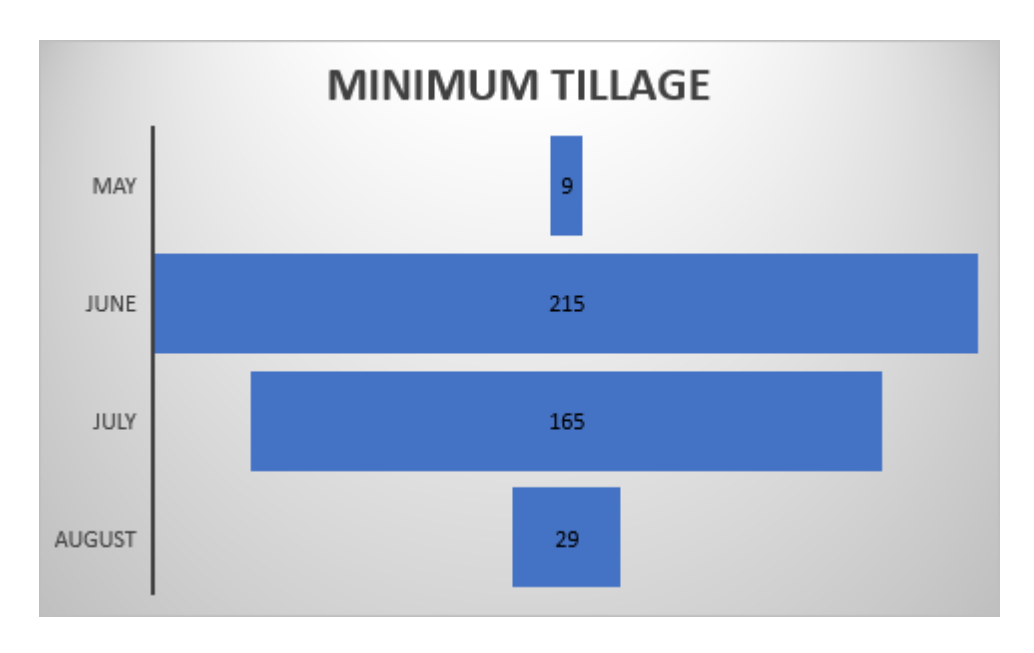
Fig. 2. Situation of collections in variant 2 – Minimum tillage work system