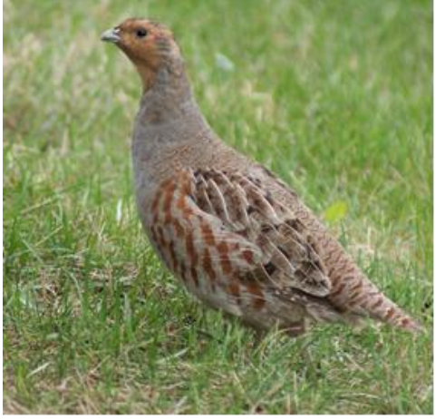
Figure 4. Partridge (Perdix perdix)

biotic and abiotic factors posing a small threat, while the quantity harvested by a worker in 8 hours is high. However, the harvesting period and the distribution range are very small, while the prices of the raw and derived products are low.