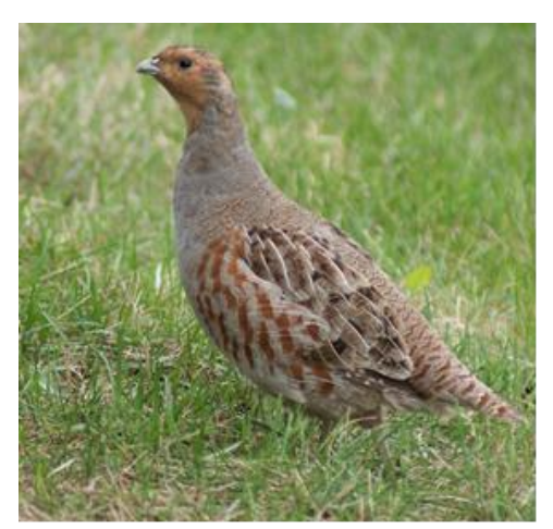
Figure 4. Partridge (Perdix perdix)

biotic and abiotic factors posing a small threat, while the quantity harvested by a worker in 8 hours is high. However, the harvesting period and the distribution range are very small, while the prices of the raw and derived products are low.