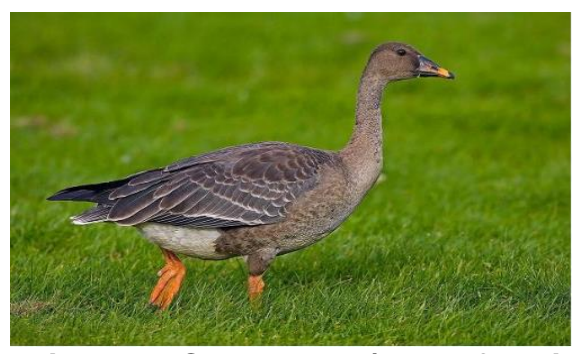
Figure. 3. Crop goose (Anser fabalis) (https://casacuperusi.wordpress.com)

Based on the AHP analysis, it can be observed that the crop goose is a rather expensive species, having high prices for the raw and derived products. Furthermore, the harvesting process is not complex, nor expensive, while the knowledge necessary for harvesting do not have to be high. On the other hand, the species is threatened by both biotic and abiotic factors, and the market request is not very high.